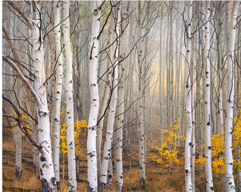
Aspen in Fog, Boulder Mountain, Utah

Opening Reception ~ Saturday, JAN 29, 5 - 7 PM